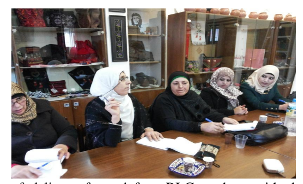
Special Project: Empowered Youth Volunteers and University Students Lead Community Change

In 2014, WCLAC's capacity building unit integrated the Radio Listener Clubs (RLCs) advocacy tool developed by Oxfam Novib into the Centre's volunteer programme as an innovative method for affecting social change. Through listening to a radio soap opera dealing with a number of social issues and discussing each episode with WCLAC volunteers, participants would enhance their listening and reflection skills and stimulate discussion with the directed objective of bringing about a change in attitude regarding traditional stereotypes and social norms. 19 volunteers trained in the media material and methods